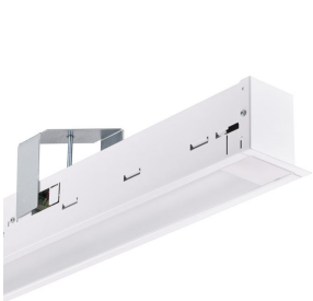
TrueLine_Recessed IP DP