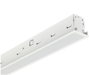
TrueLineRecessed OC OPTICS DP