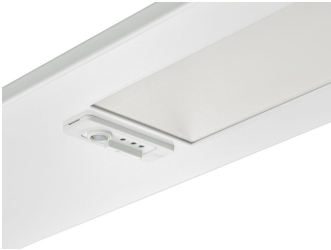
TrueBlend Recessed U4 sensor