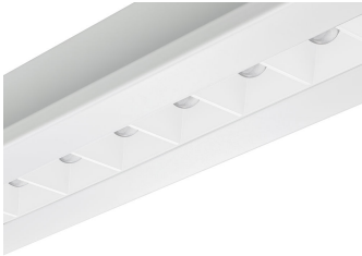
TrueBlend Recessed Mini cups- White optics DPP