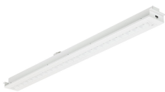
TrueBlend Recessed RC455B minicups WH U4 4FT