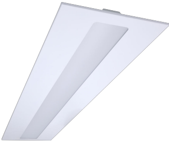
GreenPerform Troffer RC100B 30x120