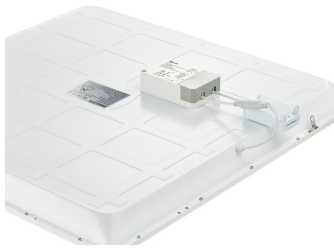
Ledinaire panel Ecoset-backplate_1