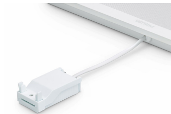
Ledinaire panel gen 4 PSU driver and closed connector