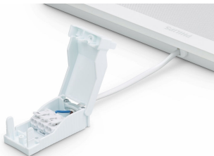
Ledinaire panel gen 4 PSU driver and open connector