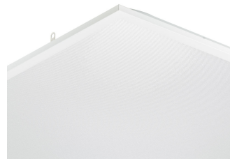
UGR19 optical exit window