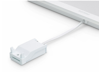
Ledinaire panel gen 4 PSU driver and closed connector