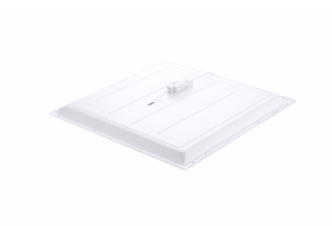
SmartBright Pro Panel