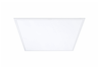
SmartBright Pro Panel