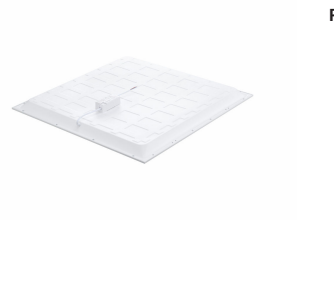
RC048 G3 Back -6060