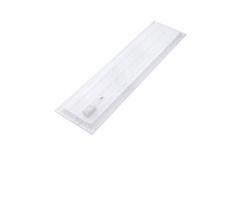
RC048 G3 Back -30120