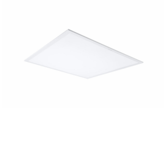
RC048 G3 standard -6060