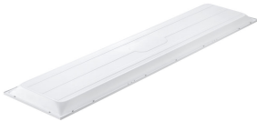
SmartBright Plus Panel