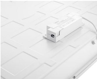
SmartBright Plus Panel