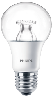
LEDbulb MAS SLR1 A60 E27 CL 1