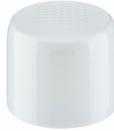
RF Segment controller for Global connectivity

NEMA 5PIN AC LV; IEC only Light Grey, light sensor, GPS