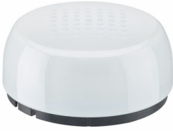
LLC745x Product Image2

NEMA 5PIN AC LV; IEC only Light Grey, light sensor, GPS