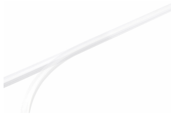
Flex Cove - Neon Indoor