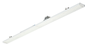
Maxos Fusion Panel-LL512X WB WH