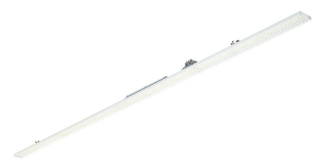
Maxos Fusion Panel-LL523X WB WH