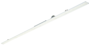
Maxos Fusion Panel-LL523X WB WH