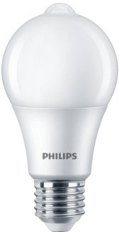
LED Sensor A60 E27 WW POS1