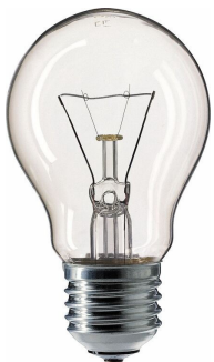
LED Lamps, CorePro LEDspotMV E27 R80