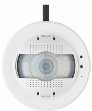
MPS3210 Detailed Product Image