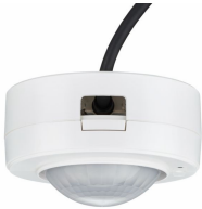
MPS3100 Sensor Product Detail Image