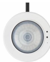
MPS3210 Detailed Product Image