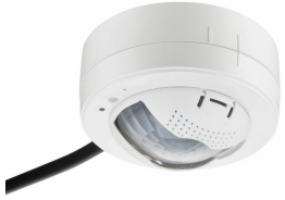
MPS3210 Detailed Product Image