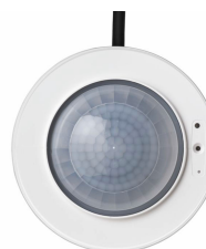
MPS3100 Sensor Product Detail Image