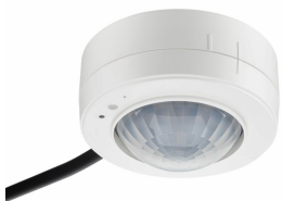
MPS3210 Detailed Product Image