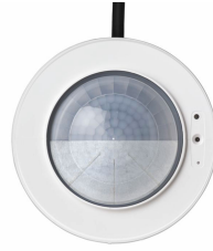
MPS3100 Sensor Product Detail Image