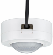
MPS3100 Sensor Product Detail Image