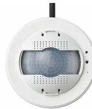
MPS3100 Sensor Product Detail Image