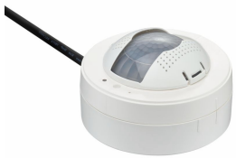
MPS3100 Sensor Product Detail Image