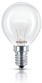
40 W E14 cap Oven Incandescent appliance bulb - RFT