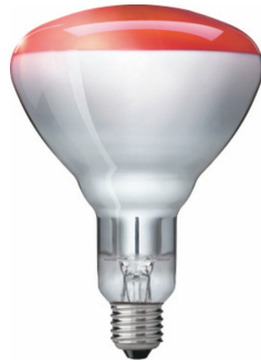
BR125 IR 250W E27 230-250V Red