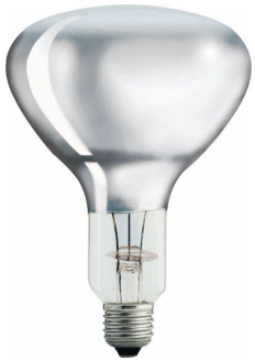
LPPR IRSG E27 R125 Clear