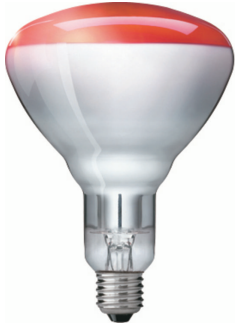
BR125 IR 250W E27 230-250V Red