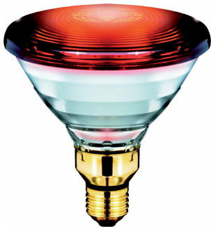
LPPR IRINPHI E27 PAR38