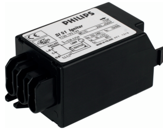
GPPR SI 0001