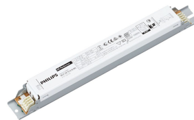
Lamp Driver, eFluo, HF-P 158 TL-D III 220-240V 50/60Hz IDC