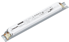
Lamp Driver, eFluo, HF-P 136 TL-D III 220-240V 50/60Hz IDC