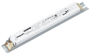
Lamp Driver, eFluo, HF-P 236 TL-D III 220-240V 50/60Hz IDC