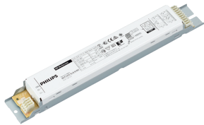
Lamp Driver, eFluo, HF-P 3/418 TL-D III 220-240V 50/60Hz IDC