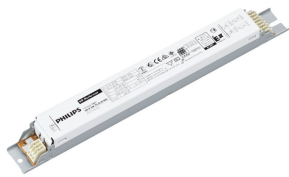
Lamp Driver, eFluo, HF-P 236 TL- D III 220-240V 50/60Hz IDC