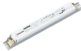
Lamp Driver, eFluo, HF-P 158 TL-D III 220-240V 50/60Hz IDC