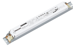
Lamp Driver, eFluo, HF-P 136 TL-D III 220-240V 50/60Hz IDC