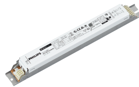
Lamp Driver, eFluo, HF-P 258 TL- D III 220-240V 50/60Hz IDC