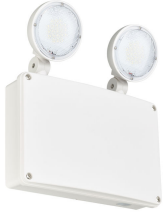
Emergency TwinSpot Wireless, spothead lights off