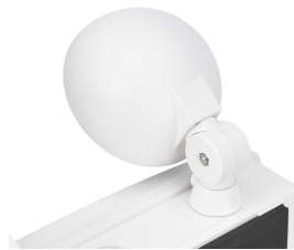
Emergency TwinSpot Wireless, spothead mechanism, upper view