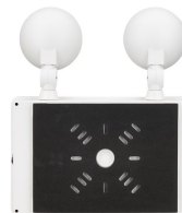
Emergency TwinSpot Wireless, backside