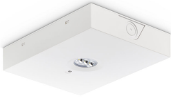
Emergency Surface Mounted Downlight HO Wireless, front view