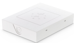
Emergency Surface Mounted Downlight Wireless, BESA mounting holes on back side