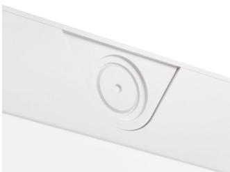
Emergency Surface Mounted Downlight Wireless, knock-out holes on the side