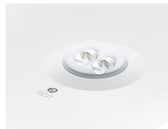
Emergency Surface Mounted Downlight HO Wireless, lens with three LEDs