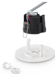
Emergency Spot Wireless, exploded view