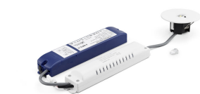
Emergency Spot Wireless, all parts