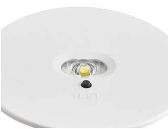
Emergency Spot Wireless, front view