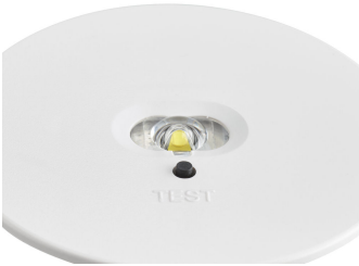
Emergency Spot Wireless, front view