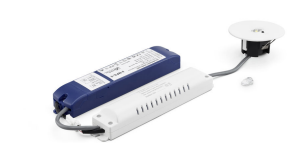
Emergency Spot Wireless, all parts