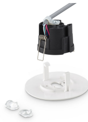
Emergency Spot Wireless, exploded view