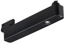
EM160T Emergency Track Spot Black