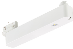
EM160T Emergency Track Spot White