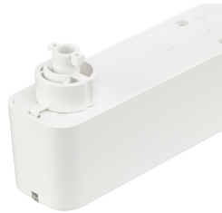
EM160T Emergency Track Spot White