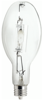
LPPR D-MP-PS EX39 ED37 CL