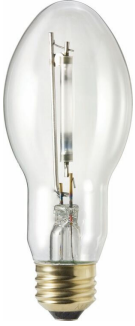
LPPR D-HPS-R BD17 CL