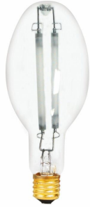
LPPR D-HPS-R 1000W ED37 CL