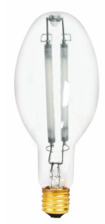
LPPR D-HPS-R 1000W ED37 CL