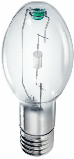
LPPR D-CDM-PS 0002