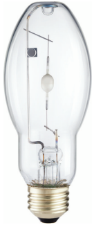
LPPR D-MHC-LW 0010