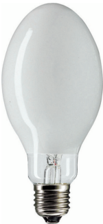
LPPR SON-I CO