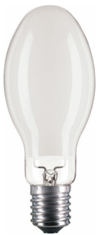
LPPR SON-PIA Plus E40