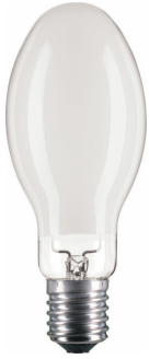
LPPR SON-PIA Plus E40