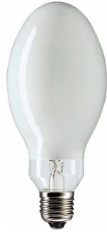
LPPR SON-PIA 0002