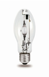
LPPR MH E26 E27 CL