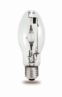
LPPR MH E26 E27 CL