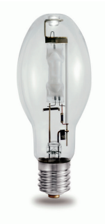
LPPR MH 0002