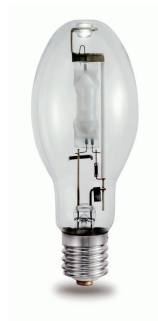
LPPR MH 0002