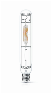
HPI-T 1000W E40