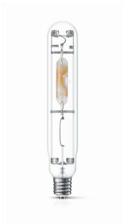
HPI-T 1000W E40