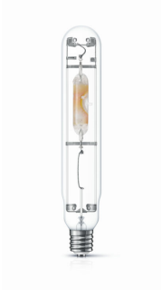
HPI-T 1000W E40