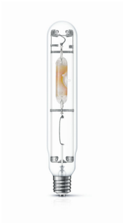
HPI-T 1000W E40