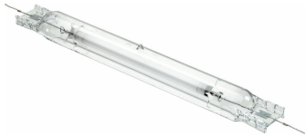
HID-GV III GP-SON