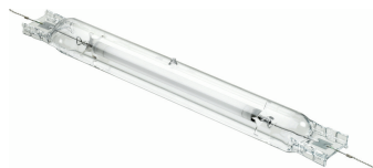
HID-GV III GP-SON